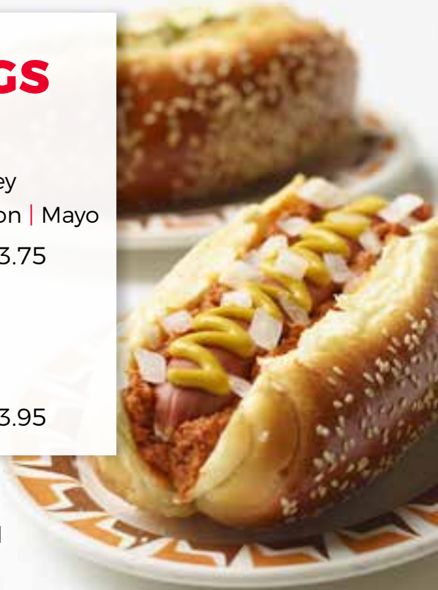
coney island hot dog