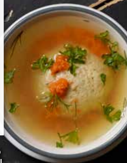
mama's chicken soup with matzah ball