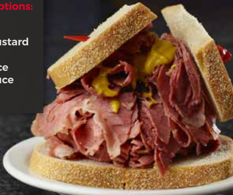
corned beef on rye