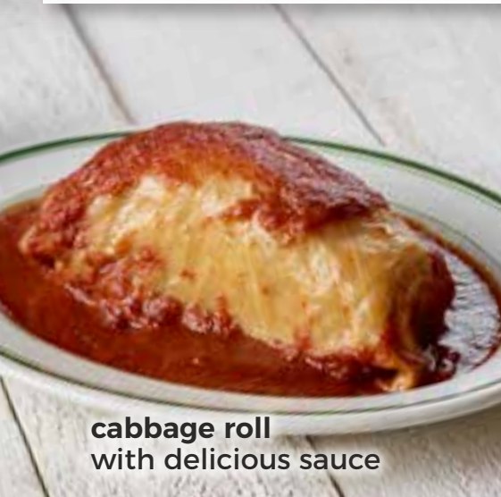
cabbage roll with delicious sauce

White chicken breast with fresh green leaf lettuce, tomatoes, carrots, hard-boiled eggs & black olives. Served with one of our homemade dressings 11.95