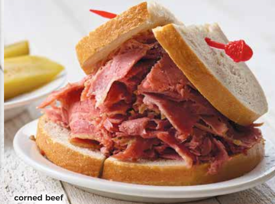
corned beef on rye