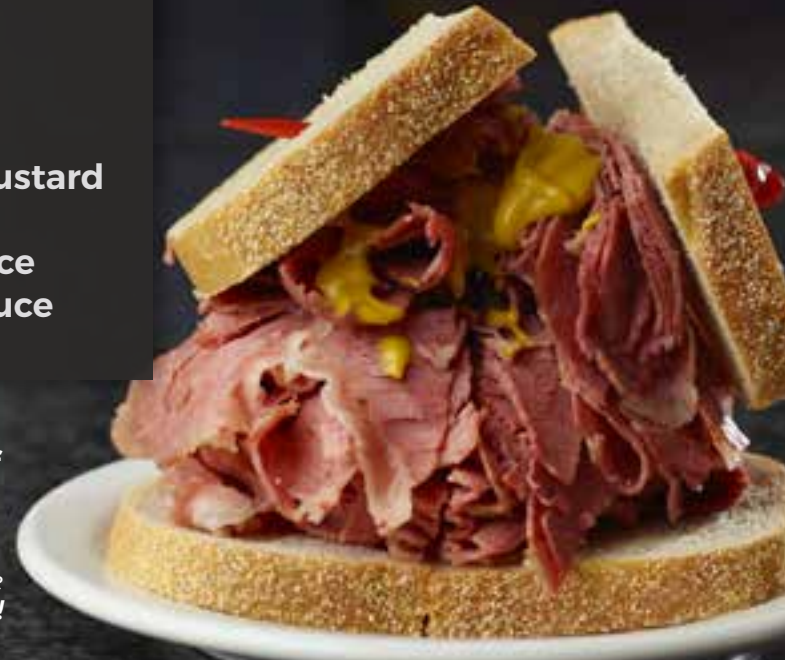
corned beef on rye

Condiment Options Mustard, Homemade Hot Honey Mustard Mayo Pastrami Sauce Cranberry Sauce Horseradish